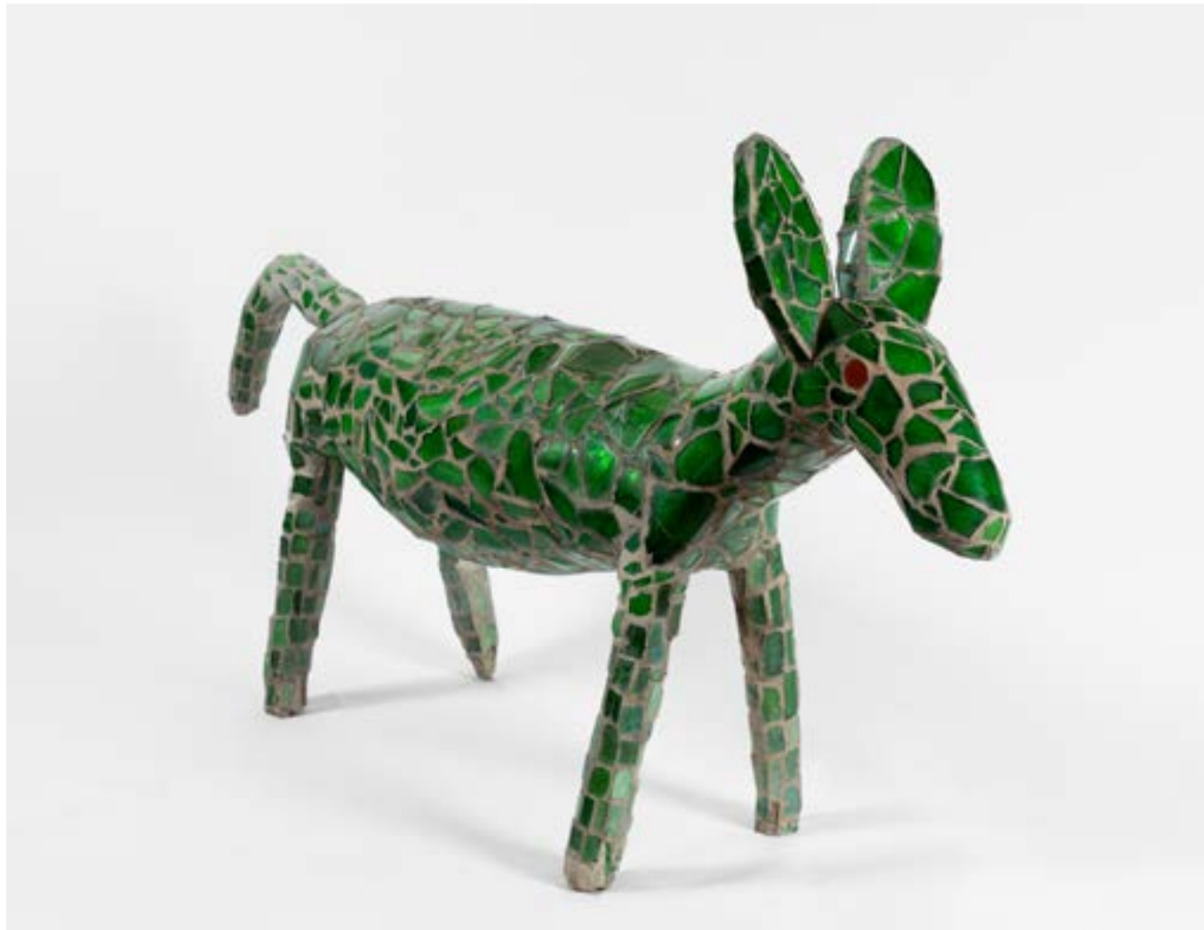
UNTITLED (DOG) , c 1980 METAL, CEMENT, CERAMIC, GLASS 64 x 126 x 25 CM, 25¼ x 49⅝ x 9⅞ IN