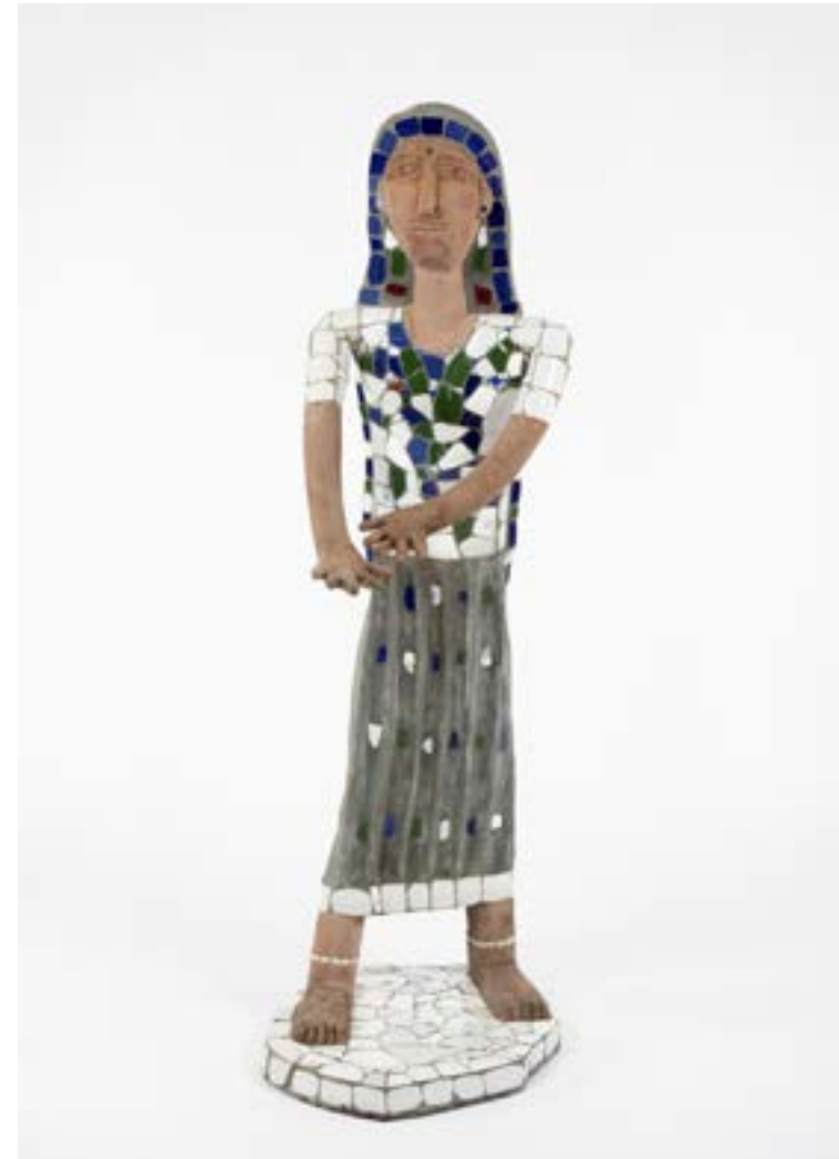
UNTITLED (STANDING LADY) , c 1980/90 METAL, CEMENT, CERAMIC 158 x 51 x 59 CM, 62¼ x 20 x 23¼ IN