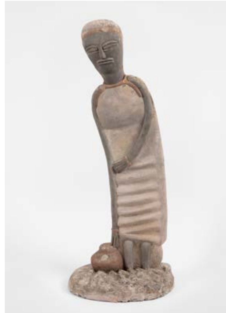
UNTITLED (LEANING LADY) , c 1980 CEMENT, STONE 86 x 36 x 27 CM, 33 7 / 8 x 14 1 / 8 x 10 5 / 8 IN