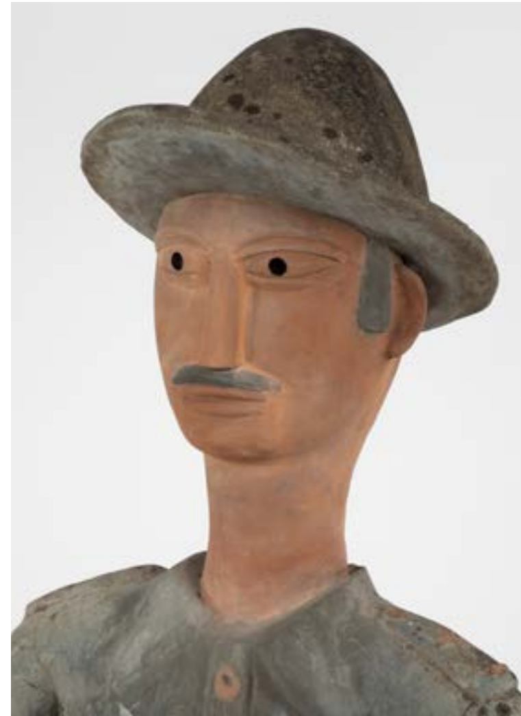
UNTITLED (OFFICIAL) , c 1980 METAL, CEMENT, CERAMIC 179 x 54 x 51 CM, 70½ x 21¼ x 20 IN