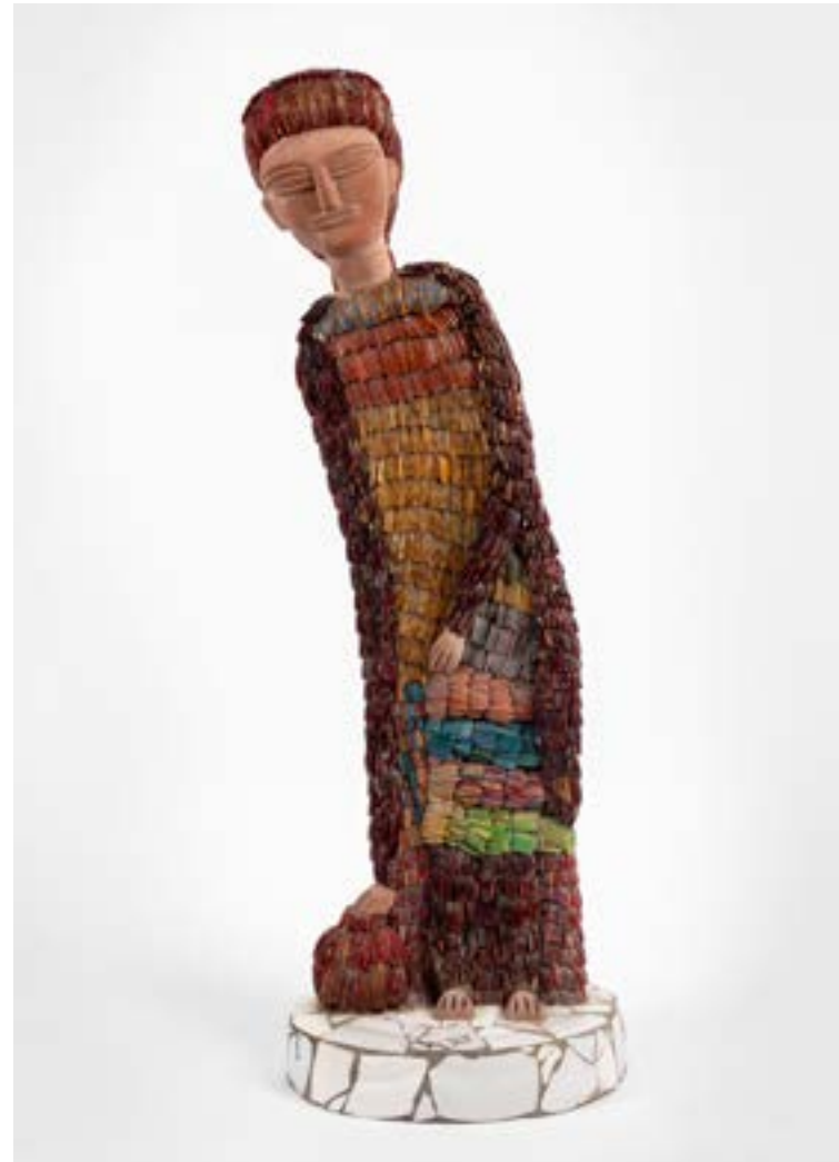
UNTITLED (LEANING LADY) , c 1980 METAL, CEMENT, CERAMIC, PLASTIC 80 x 38 x 21 CM, 31½ x 15 x 8¼ IN