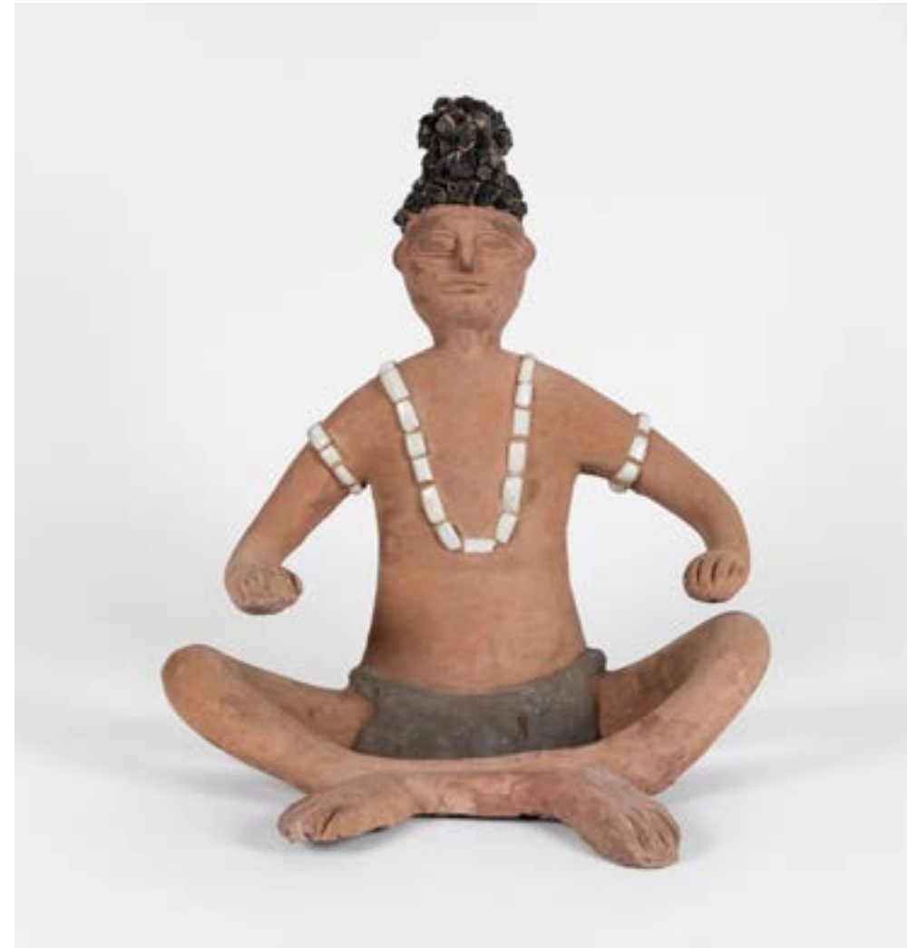
UNTITLED (SEATED FIGURE) , c 1980 METAL, CEMENT, CLINKER, CERAMIC 46 x 42 x 25 CM, 18 x 16 1 / 2 x 9 3 / 4 IN