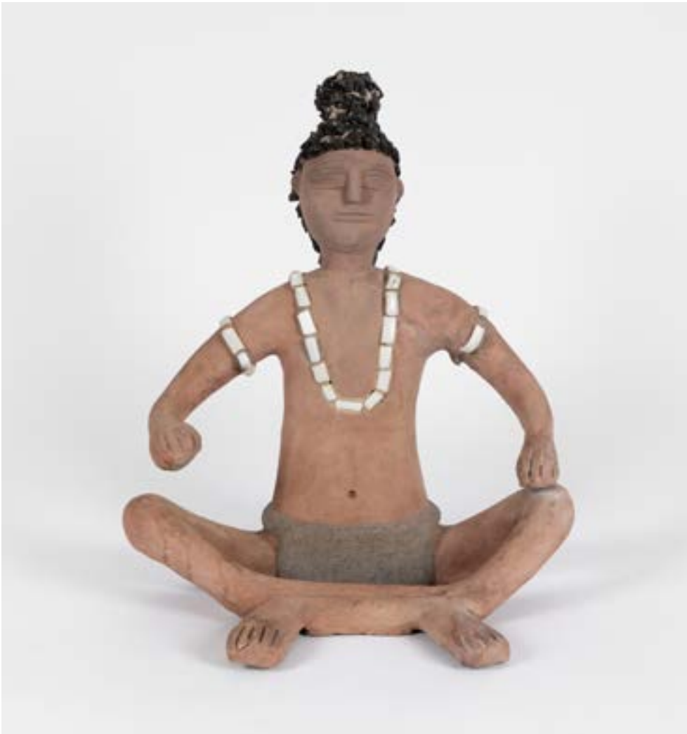
UNTITLED (SEATED FIGURE) , c 1980 METAL, CEMENT, CLINKER, CERAMIC 50 x 40 x 28 CM, 19 3 / 4 x 15 3 / 4 x 11 IN