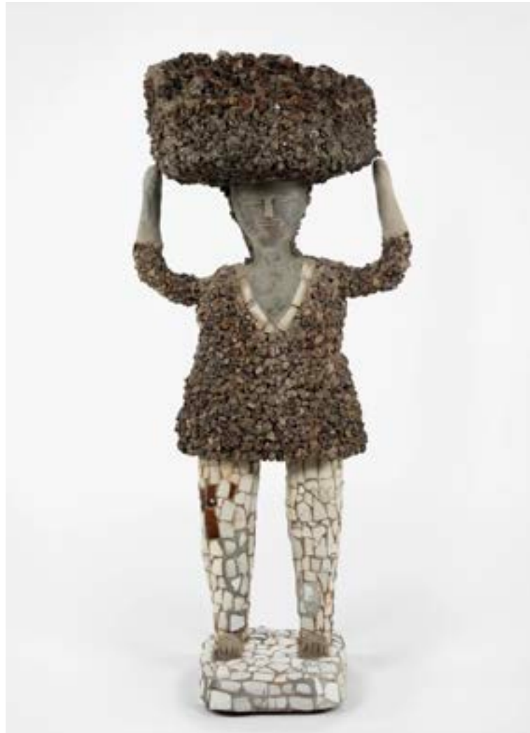
UNTITLED (HEAD BASKET) , c 1970/80 METAL, CEMENT, CERAMIC 153 x 60 x 45 CM, 60 1 / 4 x 23 5 / 8 x 17 3 / 4 IN