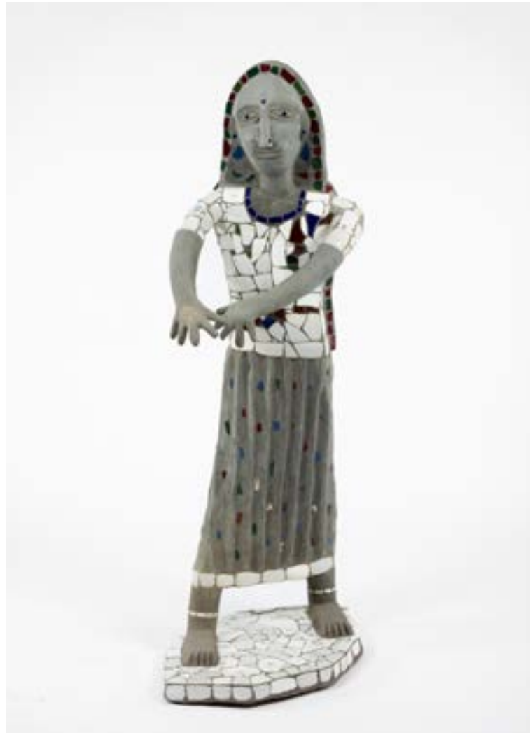
UNTITLED (STANDING LADY) , c 1980/90 METAL, CEMENT, CERAMIC 158 x 51 x 54 CM, 62¼ x 20 x 21¼ IN