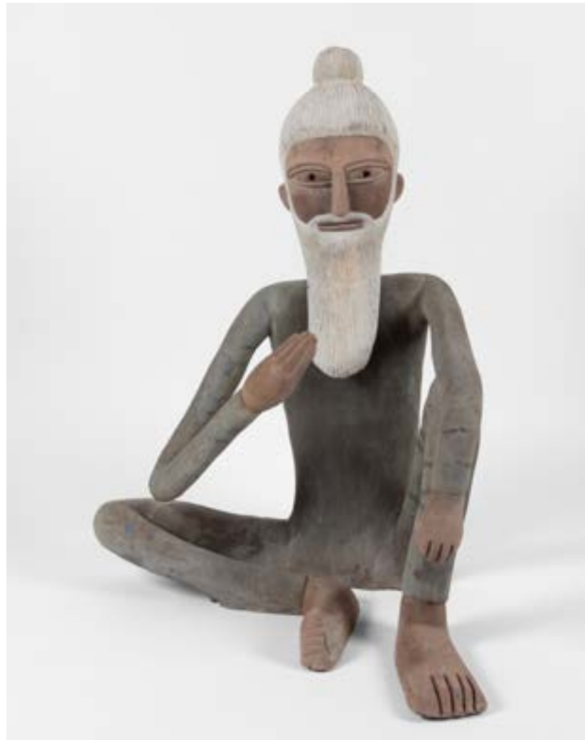
UNTITLED (SADHU) , c 1980/90 METAL, CEMENT, PAINT 91 x 63 x 56 CM, 35 7 / 8 x 24 7 / 8 x 22 IN