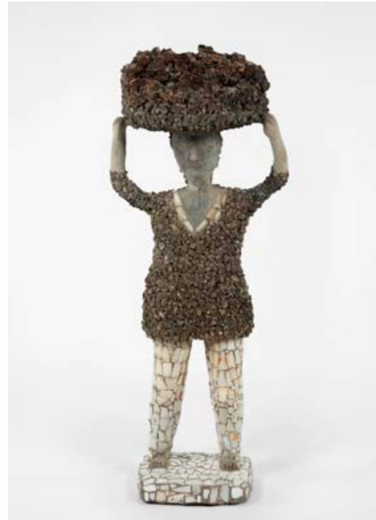
UNTITLED (HEAD BASKET) , c 1970/80 METAL, CEMENT, CERAMIC, ROCKA 139 x 59 x 46 CM, 54 3 / 4 x 23 1 / 4 x 18 IN