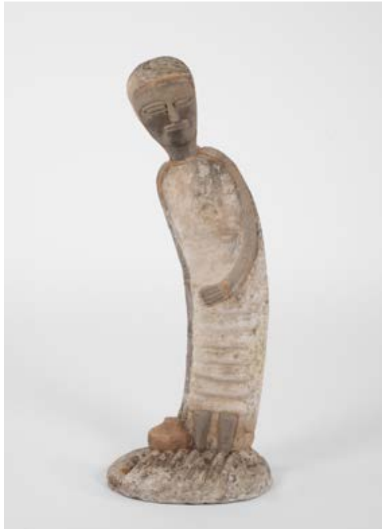
UNTITLED (LEANING LADY) , c 1980 CEMENT, STONE 77 x 40 x 25 CM, 30 1 / 4 x 15 3 / 4 x 9 7 / 8 IN