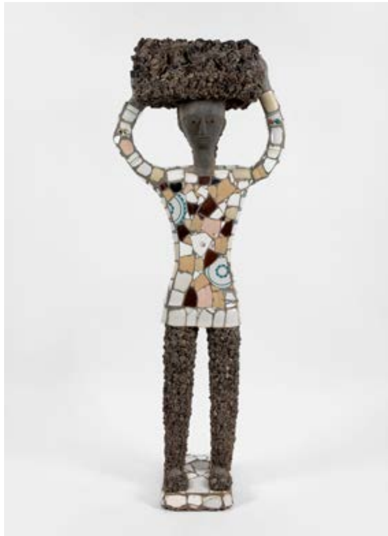
UNTITLED (HEAD BASKET) , c 1980 METAL, CEMENT, CLINKER, CERAMIC 139 x 51 x 31 CM, 54 3 / 4 x 20 x 12 1 / 4 IN