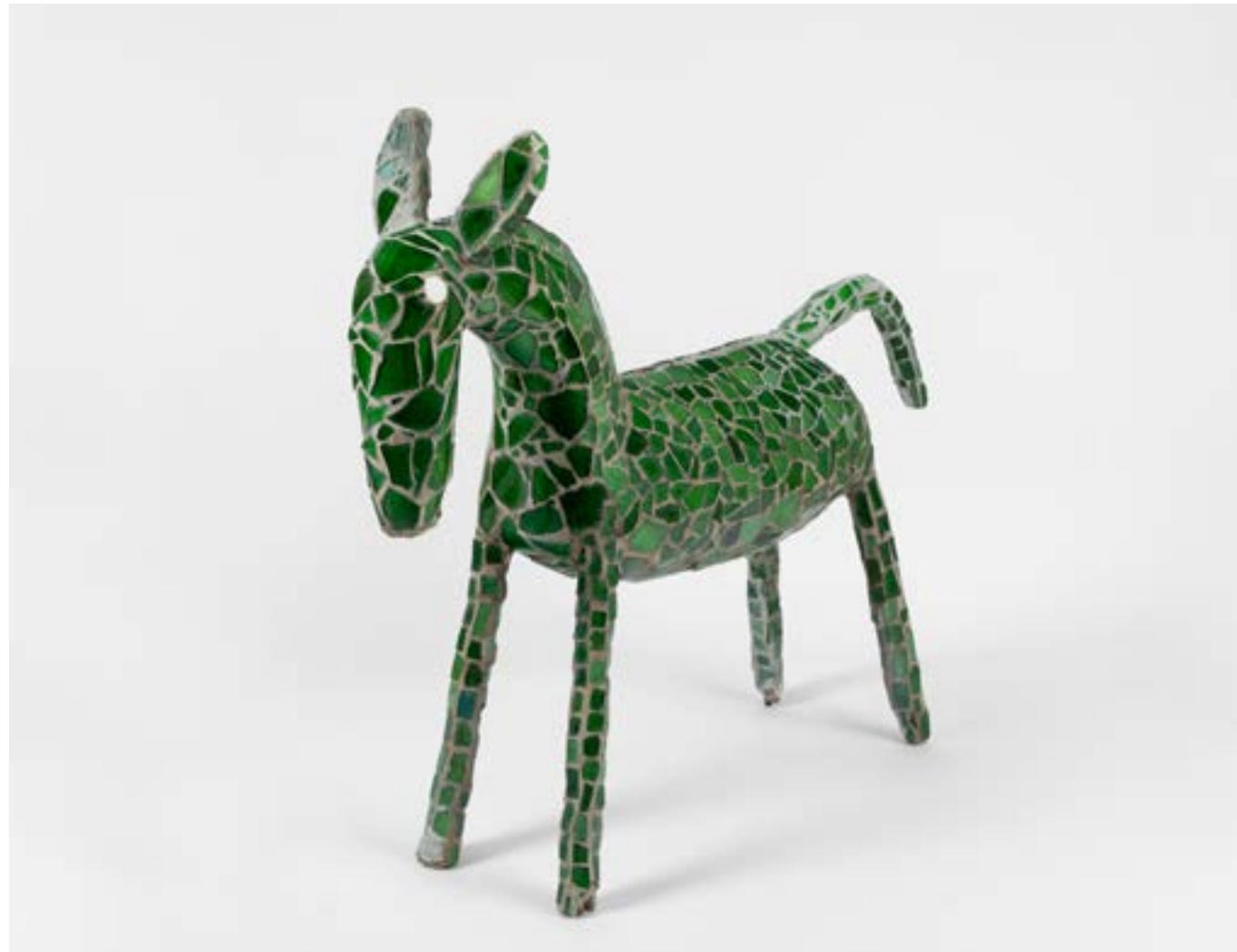
UNTITLED (HORSE) , c 1980 METAL, CEMENT, CERAMIC, GLASS 70 x 84 x 19 CM, 27½ x 33 x 7½ IN