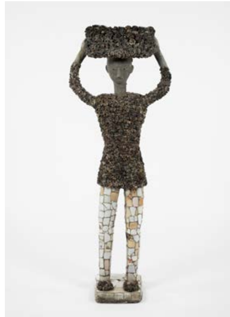
UNTITLED (HEAD BASKET) , c 1980/90 METAL, CEMENT, CLINKER, CERAMIC 145 x 54 x 31 CM, 57 x 21 1 / 4 x 12 1 / 4 IN