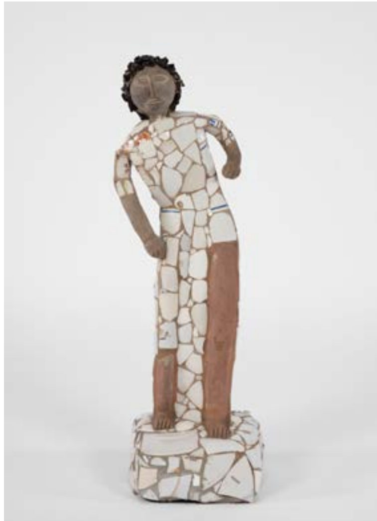
UNTITLED (LEANING FIGURE) , c 1970/80 METAL, CEMENT, CERAMIC 74 x 22 x 21 CM, 29¼ x 8¾ x 8¼ IN