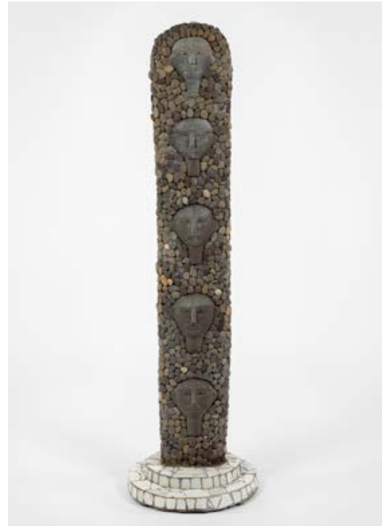
UNTITLED (TOTEM) , c 1980/90 METAL, CEMENT, STONE, CERAMIC 144 x 40 x 40 CM, 56 3 / 4 x 15 3 / 4 x 15 3 / 4 IN