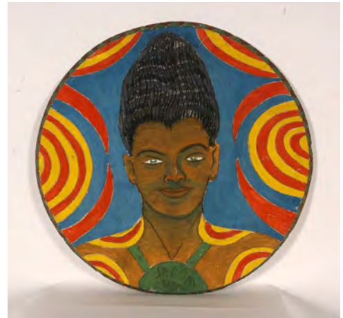
St EOM (NFS)