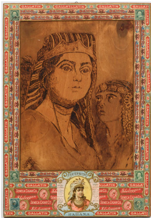
Felipe Jesus Consalvos Women (c 1920/1960) mixed media collage on wood carving 43.2 x 29.2 cm, 17 x 11 1/2 "