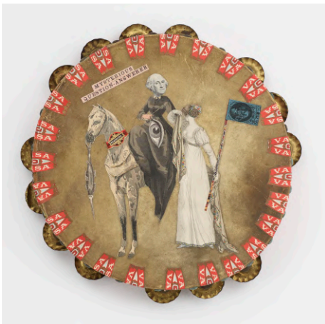
Felipe Jesus Consalvos untitled (Incarnate Human Gods) (c 1920/60) printed material, glue on tambourine 25.4 x 25.4 cm diameter, 10 x 10 " diameter