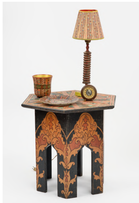
Felipe Jesus Consalvos untitled (Coffee Table) (c 1920/60) printed material, glue on plate, lamp, bottles, can, and wood table 50.8 x 58.4 x 58.4 cm, 20 x 23 x 23 "