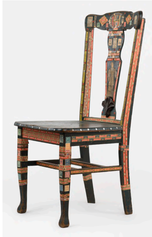
Felipe Jesus Consalvos untitled (Juan Manuel Rodriguez Chair) (c 1920/60) printed material, glue on wood chair 96.5 x 44.5 x 49.5 cm, 38 x 17 1/2 x 19 1/2 "