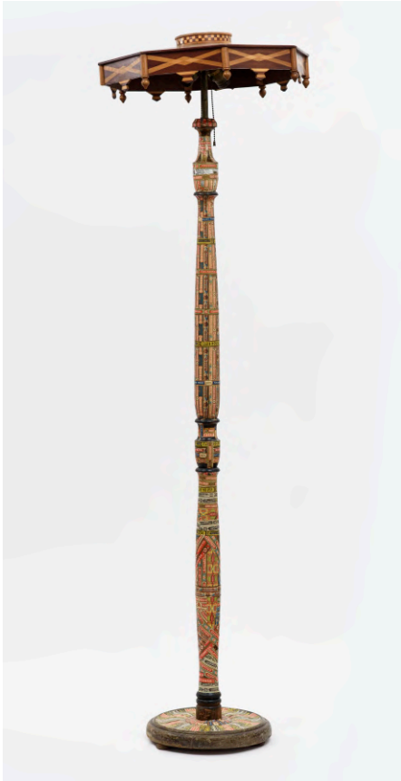
Felipe Jesus Consalvos untitled (Floor Lamp) (c 1920/60) printed material, glue on lamp 162.6 x 44.5 x 44.5 cm, 64 x 17 1/2 x 17 1/2 "