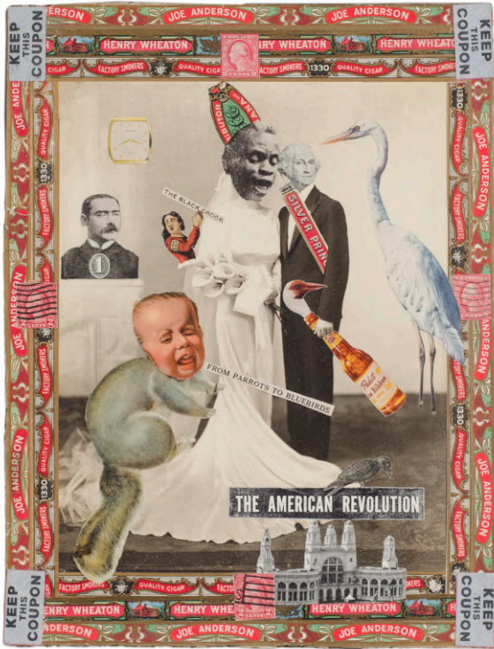
Felipe Jesus Consalvos untitled ( The American Revolution ) (c 1920/60) printed material, glue on photograph 31.8 x 24.1 cm, 12 1/2 x 9 1/2 "