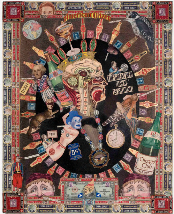
Felipe Jesus Consalvos untitled ( The Great Red Dawn is Shining ) (c 1920/60) printed material, glue on paper [recto/verso] 62.9 x 50.2 cm, 24 3/4 x 19 3/4 "