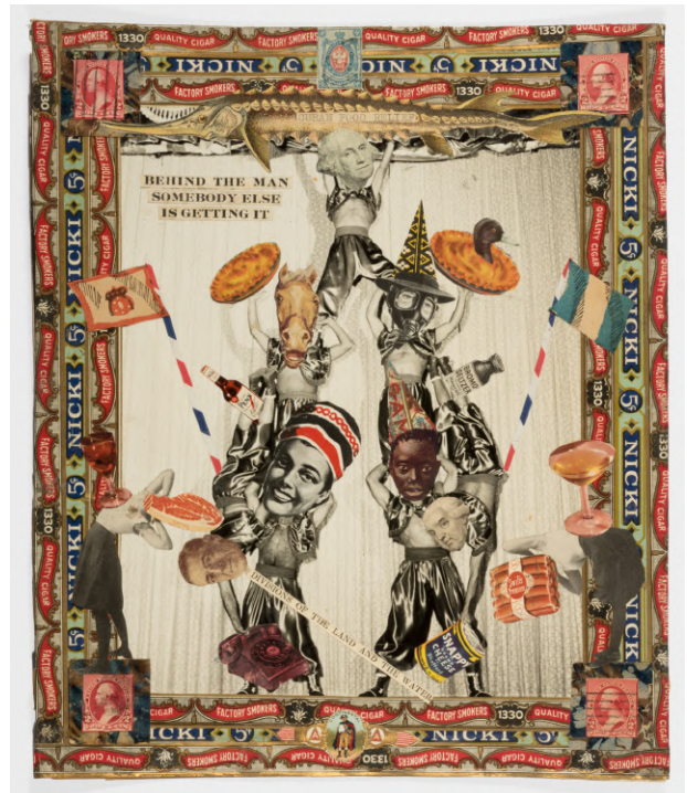
Felipe Jesus Consalvos untitled ( Behind the Man Someone Else is Getting It ) (c 1920/60) printed material, glue on print 27.9 x 23.5 cm, 11 x 9 1/4 "