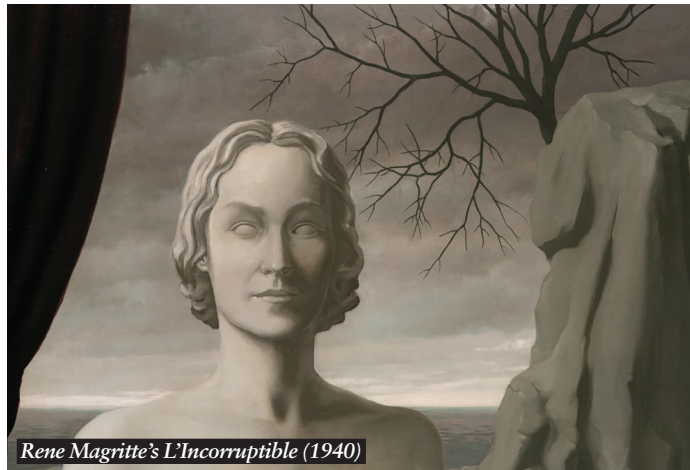
René Magritte's L'Incorruptible (1940)

But recently, "seismic shifts have occurred" that have stretched the boundaries of the art movement to its limits. Modernism needs to be made modern again. That is something